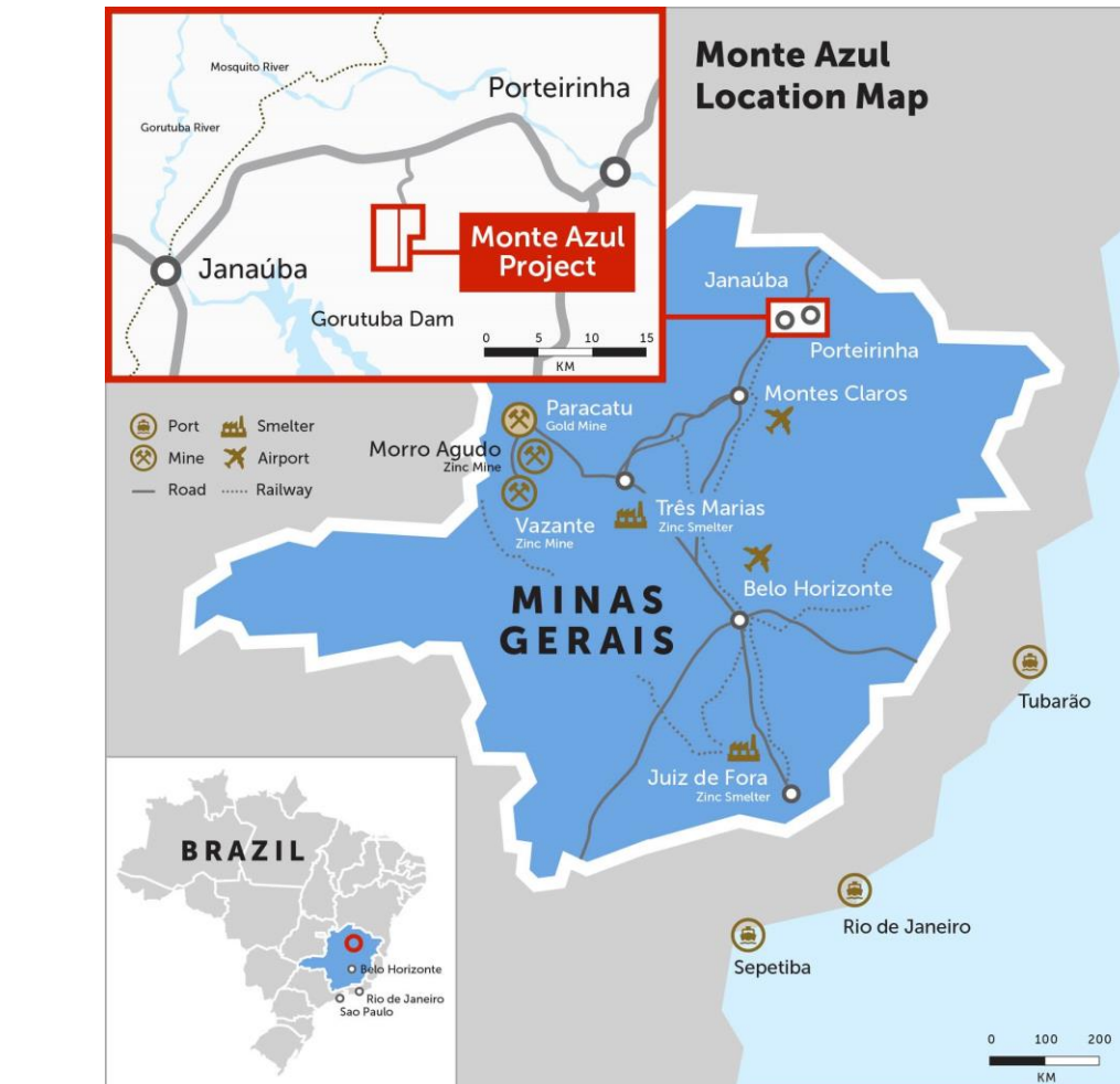
Figure 1: Location of the Monte Azul Project

Located in the established mining state of Minas Gerais (Figure 1), close to rail facilities, grid power and water, local suppliers and mining services, with other operating zinc mines and a smelter in the same state