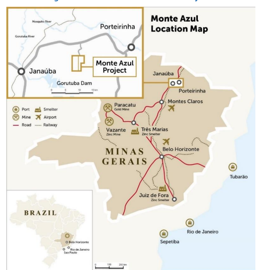
Figure 1: Location of the Monte Azul Project

Nexa's Vazante and Morro Agudo zinc operations, and Tres Marias zinc smelter lie are located in the same state.. Grid power and water are available locally, as are suppliers and mining services with the towns of Porteirinha (~40,000 inhabitants) and Janaúba (~70,000 inhabitants) both located ~18km away on the highway.